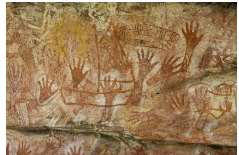
Picture above: courtesy of Tourism Australia ( http://australia.com )