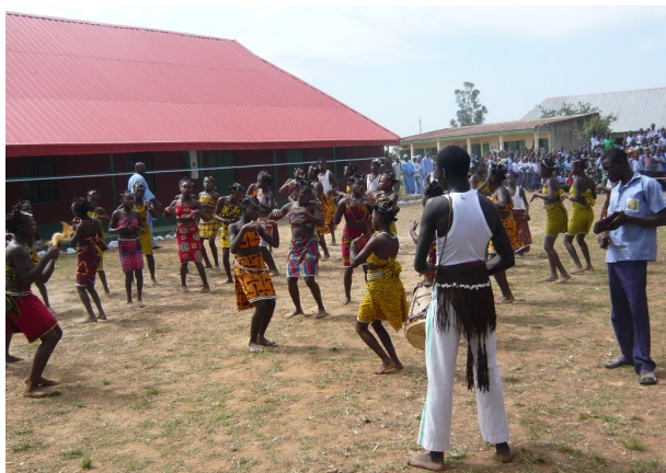
Students performing at the ceremony for the commissioning of the Mangu Science Lab

Education: Funding has been provided for the renovation of schools, the provision of school furniture and the building of pit latrines in communities in the FCT, Abia, Nasarawa, Edo, Plateau, Rivers, Akwa Ibom and Taraba states. Given the importance of science and technology education, the High Commission also funded a science laboratory at the Mangu Government Senior Secondary School in Plateau state, which encouraged the state government to provide the school with science equipment. The laboratory was inaugurated on 28 October, 2010.