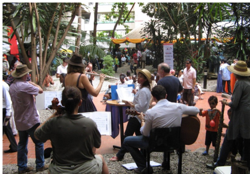
“Aussie Bush Band Buskers”