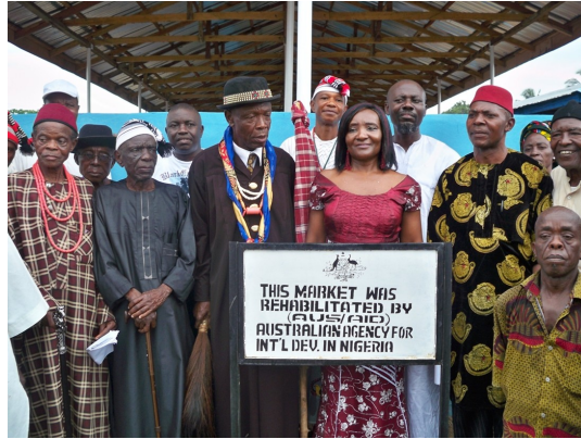
Latonia Dabiri-Mpamugo with local dignitaries in front of the new market stalls, Item community, Abia state

In Imo state, the High Commission funded a poultry project that aims to reintroduce poultry keeping into rural communities, thus creating jobs and providing a regular supply of eggs and meat. Families in the community who participate in the project receive a number of chicks on a revolving loan basis (i.e. no cash up front), which is repaid after six months when the chickens can brood and be