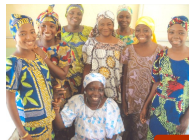
Some of the Obstetric Fistula patients

Nigerian Fistula Foundation: In 2009-10, the High Commission continued with its support for