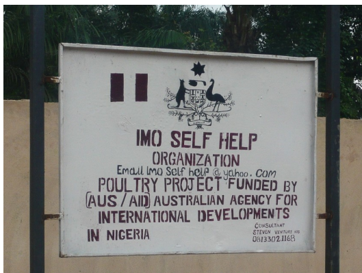
At site of the poultry in Imo state

In Cameroon, a grant was provided to a local Cameroonian NGO in Buea - Forestry, Agriculture, Animal and Fishery Network - to rehabilitate water catchment areas on Mount Cameroon. This includes the building of tanks and the rejuvenation of the plants around the water catchment areas. The primary benefit of the project to the communities involved is to secure future access to water resources, which are currently under pressure from encroachment and economic development.